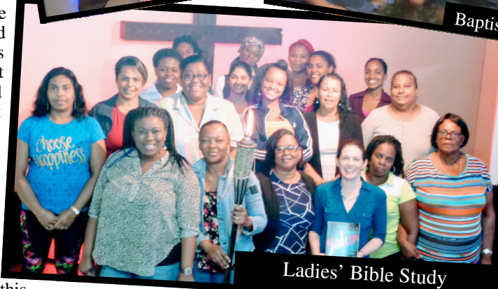
Ladies' Bible Study

topic specifically with our teens, young adults, and married couples. However, because Carnival is viewed by many as simply part of Trinidad's culture, there are many people who struggle with temptation and put themselves in compromising situations during this time. "But thanks be to God who giveth us the victory through our Lord Jesus Christ!"